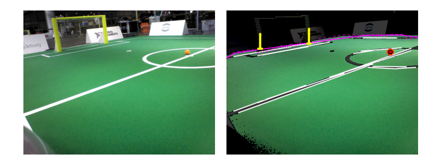
Fig. 2. Original image (left) and a visualization of the processing results (right) for a sample image. Detected elements are highlighted: Field border (magenta) and field pixels, goal posts (yellow), line-segments (white), and ball (red).

Our team uses a vision algorithm strongly inspired by [7]. Like our motion module, the vision module is also implemented in C/C++ and replaces the Aldebaran video device module. To accelerate image aquisition, we are using Video4Linux to capture images from both cameras in parallel.