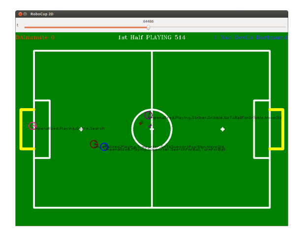
Fig. 4. Team Viewer showing a replay of a situation in a game.

To help assessing the effects of code-changes (primarilly for behavior) to the team's in-game perfomance, we are using a modified version of the SimSpark 3D soccer simulator from Nao-Team Humboldt<sup>3</sup> and continuous integration to let recent versions play against their predecessors.